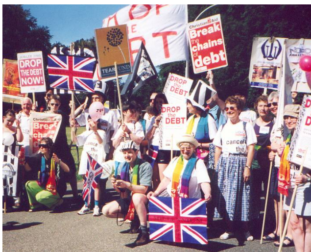
Right: NE campaigners in Cologne, where we won our first major victory.

This will be a peaceful, good humoured and fun occasion – all our rallies have been just that. The world leaders don't arrive until the following weekend and, even then, they will be at Gleneagles, many miles away, so there will be nothing at all about our event to invite trouble. Of course, nothing in life is 100% risk-free but, realistically, there is more reason for concern about road accidents, than about trouble in Edinburgh! However, the event is perfectly timed and placed to influence public and political opinion.